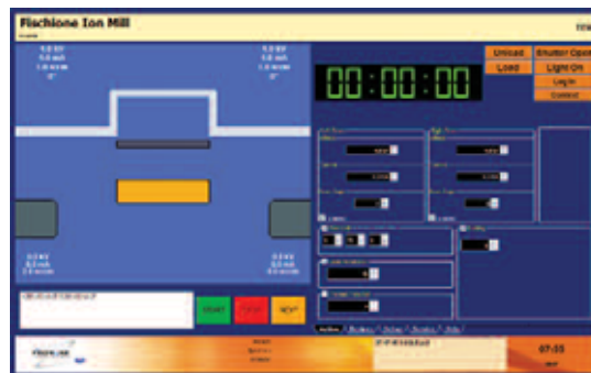
TEM Mill program window

During operation, relevant parameters are displayed in real time on the computer monitor. When controlled by the computer, the touchscreen displays a Pause button so that, if necessary, instrument operation can be quickly suspended.