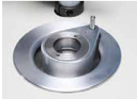
Load lock closed

After venting, the specimen can be rapidly transferred to the TEM, thus reducing contamination from the ambient.