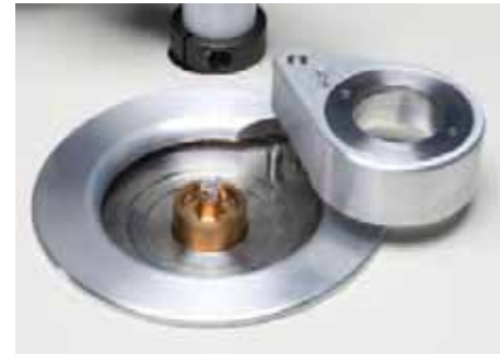
Load lock open