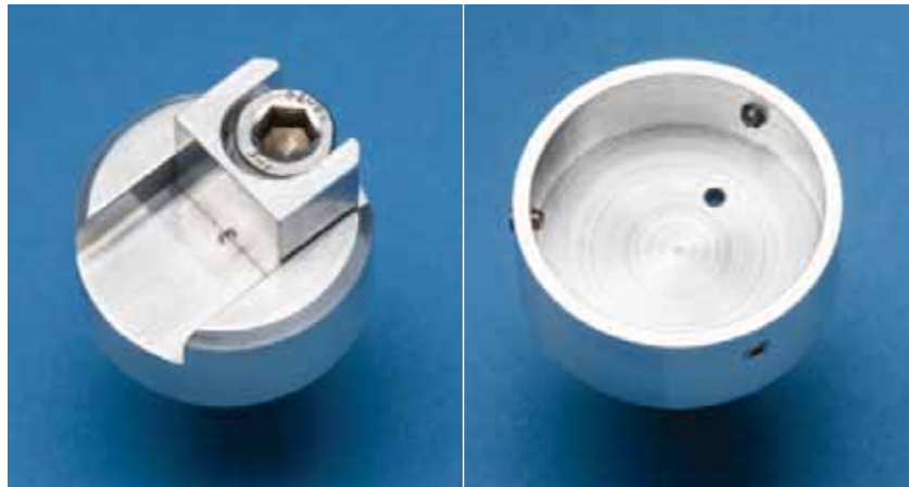
Various sample holders

A series of sample holders are available for a multitude of applications. Loading stations further facilitate the sample handling process.