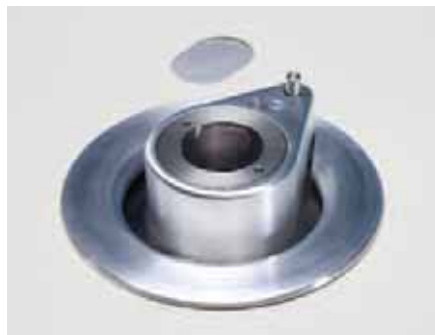
Load lock closed

After venting, the sample can be rapidly transferred to the SEM, thus reducing contamination from the ambient.