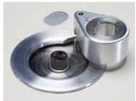
Load lock open