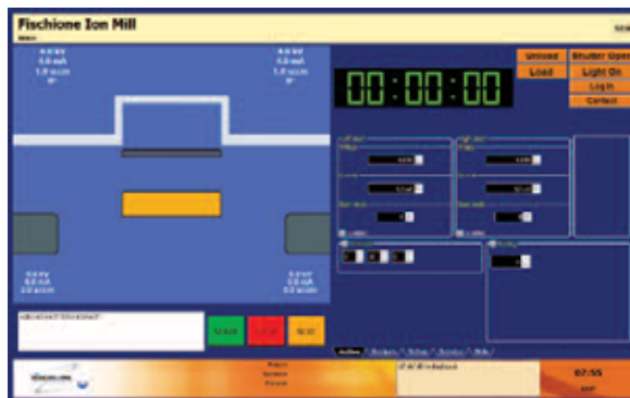
SEM Mill program window

During operation, relevant parameters are displayed in real time on the computer monitor. When controlled by the computer, the touchscreen displays a Pause button so that, if necessary, instrument operation can be quickly suspended.