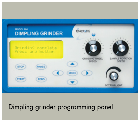
Dimpling grinder programming panel

Programming is extremely easy via a keypad mounted on the front panel. Prompts guide you